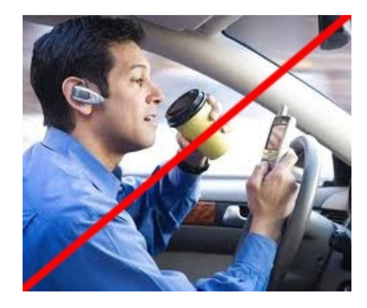
Recognize hidden dangers and estimate the road correctly

The technical condition of the vehicle must be okay: air pressure and profile of the tires, steering, brakes, shock absorbers, lighting fully functional.